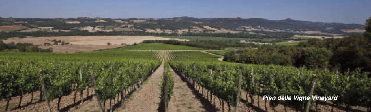
Pian delle Vigne Vineyard